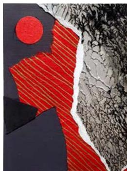
Exhibit will be on display: Friday, March 20–Monday, April 20 All are welcome! See page 11 for more details.

Artist Reception: Sunday, Sunday, March 22 1:00–3:00 PM