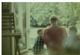
“Sing to the Power”