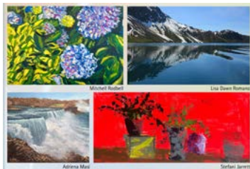
Exhibit on display through Tuesday, March 17 All are welcome!