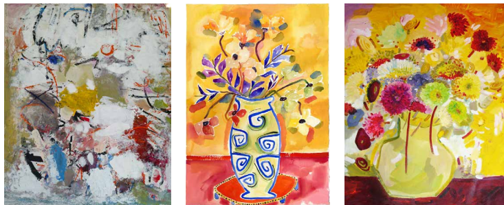
Exhibit is on display: Saturday, December 6, 2025–Monday, January 5, 2026 All are welcome!