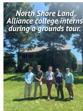
North Shore Land Alliance college interns during a grounds tour.

Offering experiences for three very different age groups has been a practice of fine tuning to appropriate interests and attention spans: from puppet demonstrations of butterfly metamorphosis to explaining how the trajectory from college to career is often twisty and turvy and a suitable match takes time.