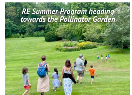
RE Summer Program heading towards the Pollinator Garden