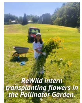
ReWild intern transplanting flowers in the Pollinator Garden.