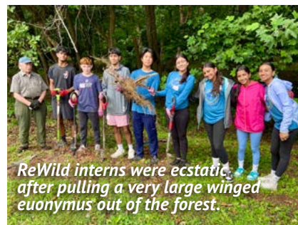
ReWild interns were ecstatic after pulling a very large winged euonymus out of the forest.