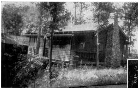
JAMES F. ALEXANDER CABIN

The Electric Power Board of Chattanooga extended its power lines to the Club's property and made electric current available to the Club in December, 1947. Lights were installed by the Club at various locations in the Club area early in 1948.