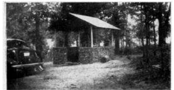
WELLHOUSE ON CLUB GROUNDS

Improvements are constantly being made on the club property. There is a well which provides the finest of drinking water, a pavilion, equipped with tables on which meals may be served under shelter, a small oven for use by parties for steak frys