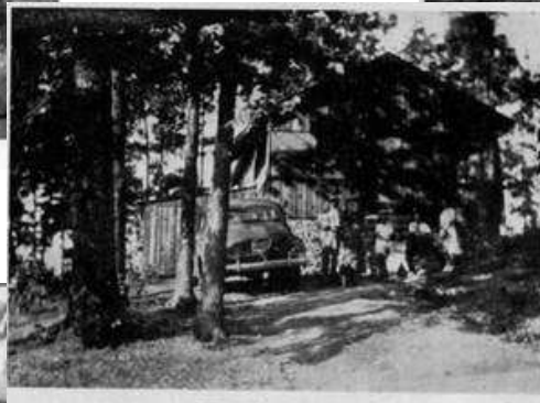
THE O. W. RUSS CABIN