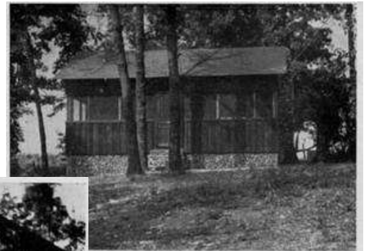
THE COTTAM CABIN "TIMBUCTO"