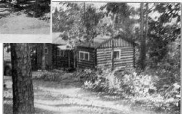
JIM WATSON'S CABIN