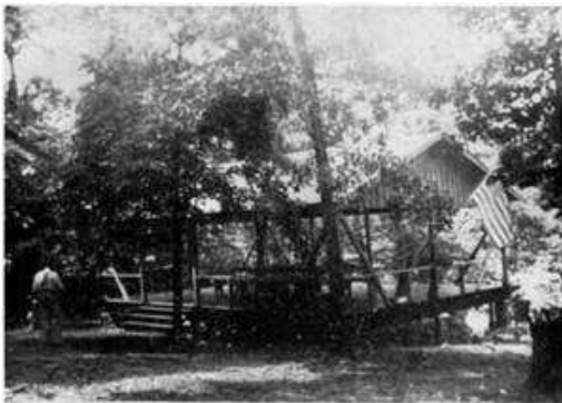
PAVILION ON CLUB GROUNDS

The club's property is paid for today. From a dense tract of woods, the area has now become an attractive recreation park with a number of lovely cabins that are delightful summer homes. The boat harbor is equipped with buoys, docks, and lockers to accommodate the large number of fishing and pleasure craft of members. The club maintains a caretaker who lives on the property year 'round.