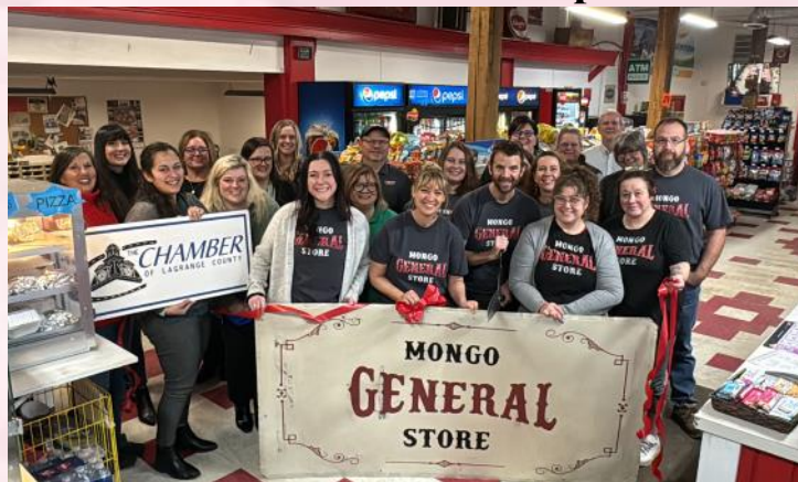
Pictured above: The staff of the Mongo General Store pose during their ribbon cutting on January 22nd with the LaGrange County Chamber staff and members of the Chamber Ambassadors.