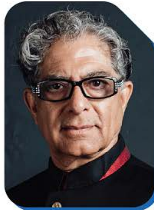
Dr. Deepak Chopra Founder, Chopra Center for Wellbeing Honored Special Guest