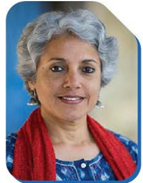
Dr. Soumya Swaminathan Chief Scientist, World Health Organization Keynote Speaker