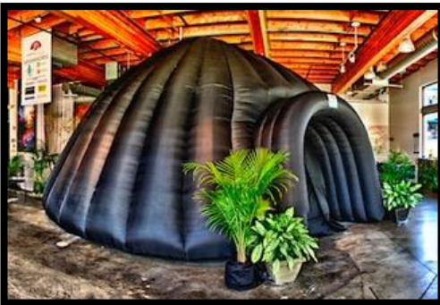
For the love of Math