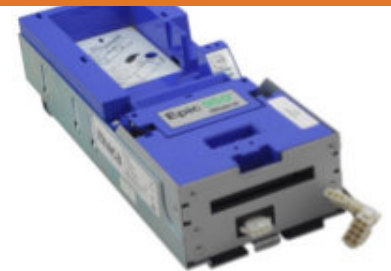
CASINOTECH TRANSACT Epic 950 - SPARE PART LIST