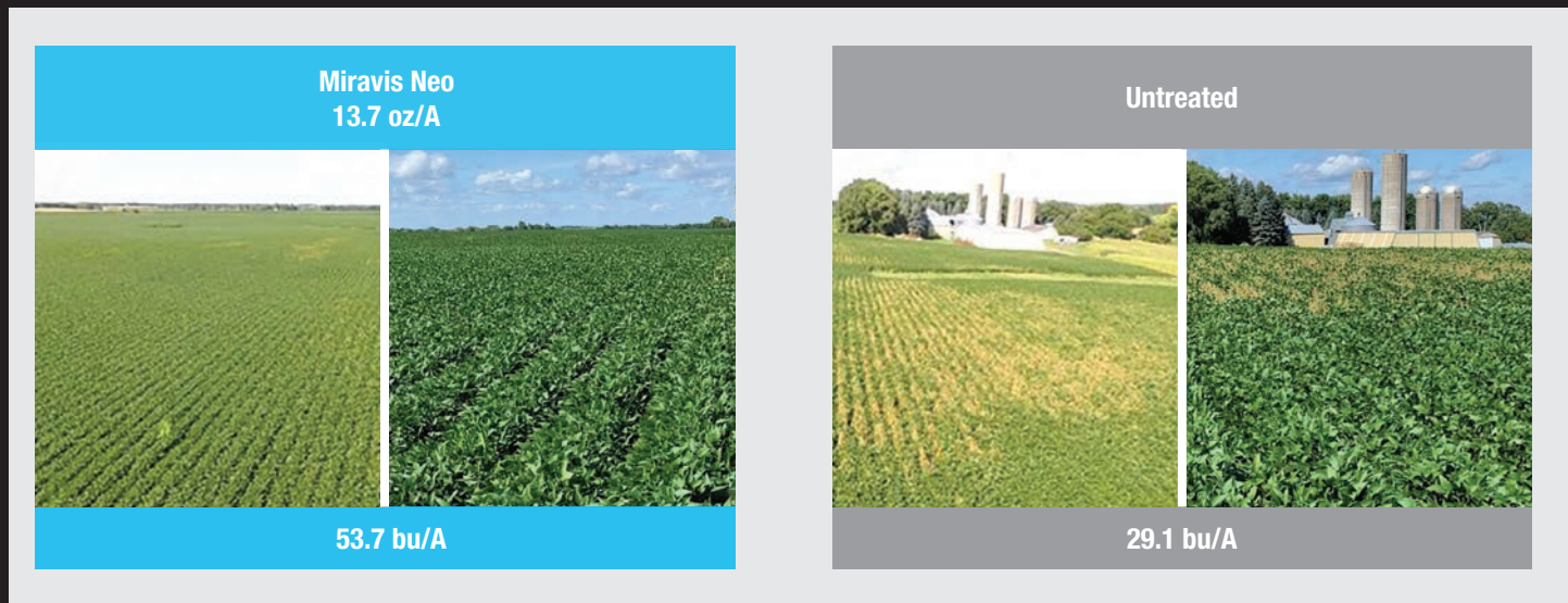
Dassel, Minnesota. September 6, 2019. Miravis Neo applied at R2 Soybeans 13.7 oz/A

The proof is in the performance. With better disease control and two active ingredients that deliver plant-health benefits, Miravis Neo helps you grow a stronger, healthier crop to consistently help maximize ROI.