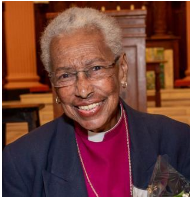
The Rt. Rev. Barbara C. Harris

It has been said that God's time and ours met on Feb. 11, 1989, when Barbara C. Harris became the first woman to be ordained a bishop in the worldwide Anglican Communion. On that day, while the world watched, a woman donned the symbolic regalia of the church's highest order for the first time—an African-American woman and one who had not followed the traditional path to the episcopacy.