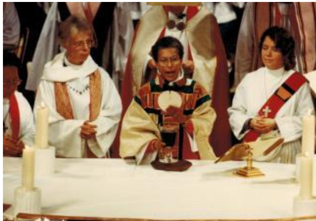
DIOCESE OF MASSACHUSETTS