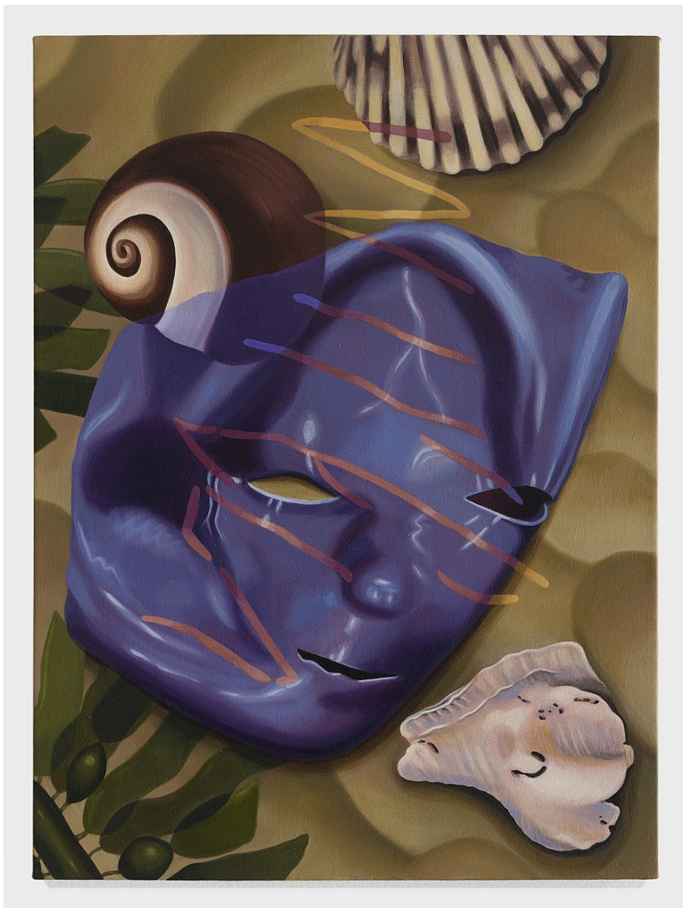
Kristen Sanders Abyssal Plane , 2023 Acrylic on canvas 27h x 20w in 68.58h x 50.80w cm KS010