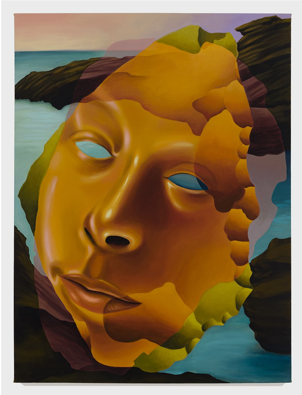
Kristen Sanders Shell/Tool , 2023 Acrylic on canvas 40h x 30w in 101.60h x 76.20w cm KS005