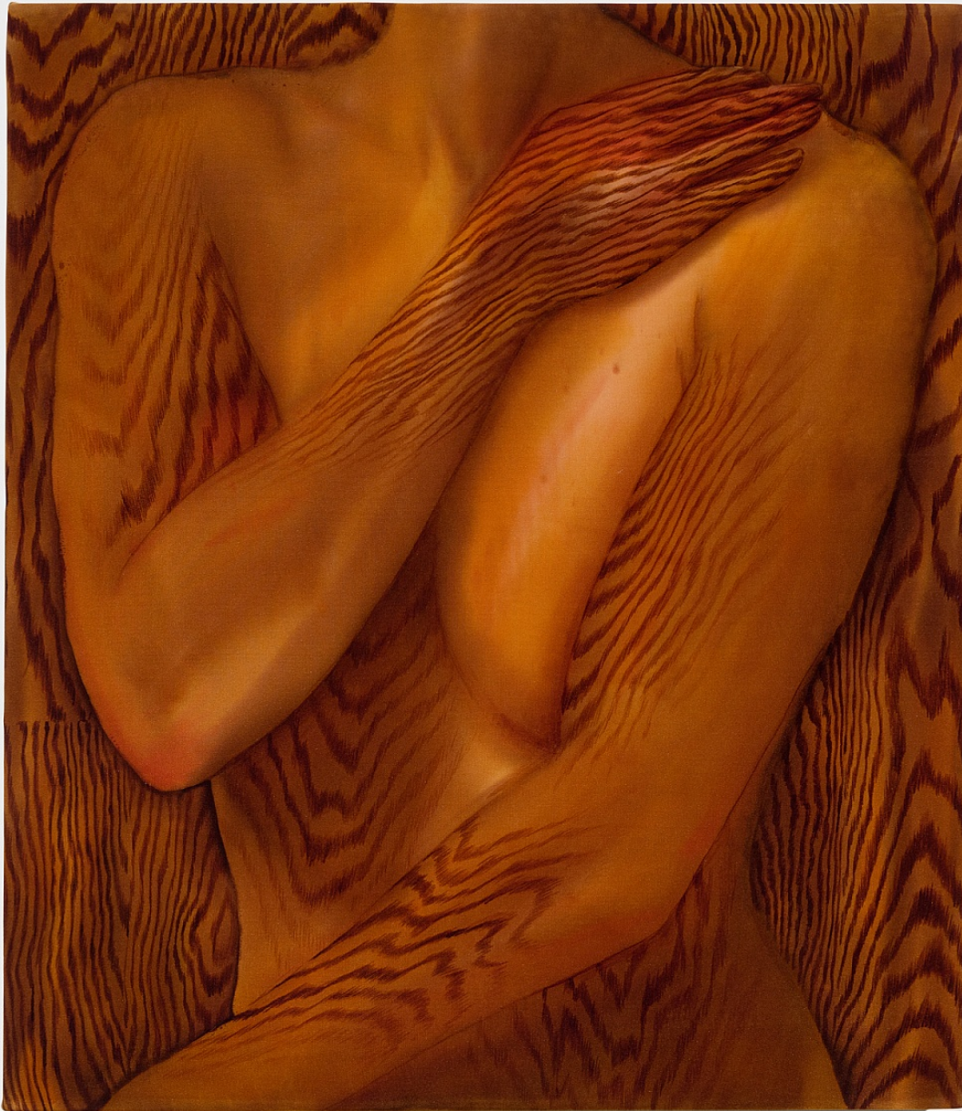
Katarina Riesing The Discovery , 2023 Dye on silk crepe de chine 19h x 16.50w x 1d in 48.26h x 41.91w x 2.54d cm Riesing051