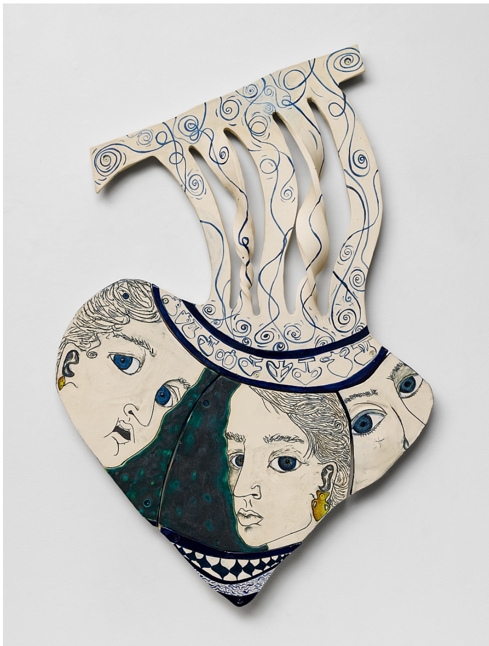
Gabriela Vainsencher Three Muses of Flowing Abundance (Maiden, Mother, Crone) , 2023 Porcelain, glaze, underglaze and acrylic 30h x 20w in 76.20h x 50.80w cm GV029