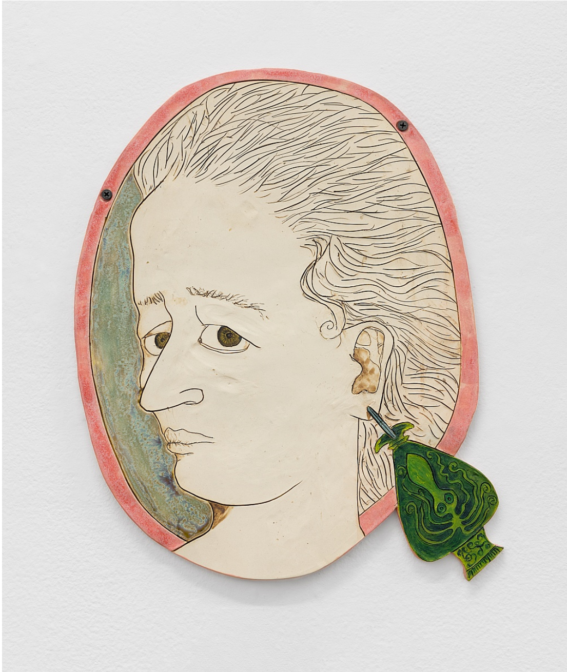
Gabriela Vainsencher Sea Mother , 2023 Porcelain, glaze, underglaze, acrylic 15.50h x 14w in 39.37h x 35.56w cm GV008