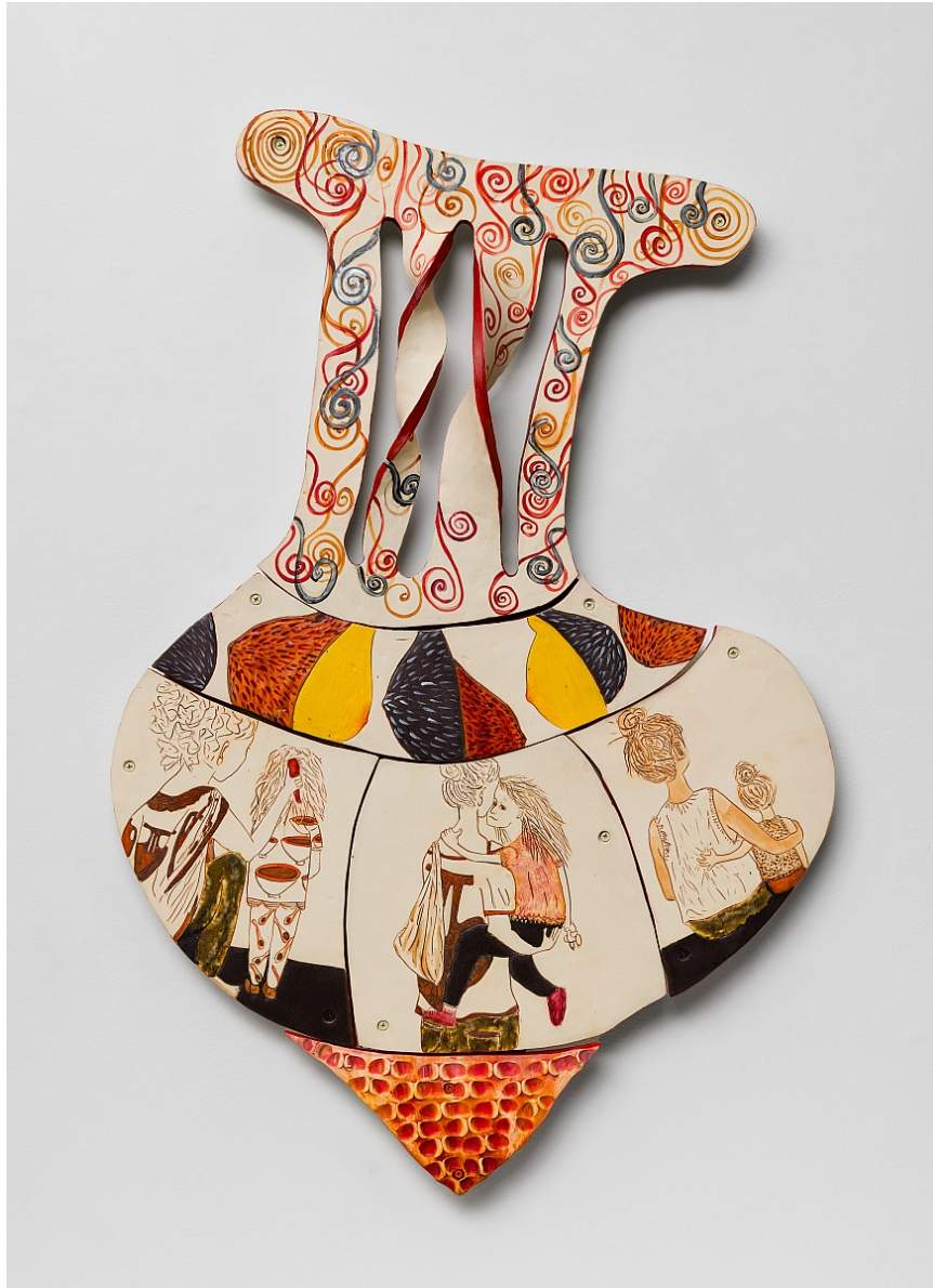
Gabriela Vainsencher Epic, Heroic, Ordinary Again, 2023 Porcelain, glaze, underglaze, and acrylic 30h x 20w in 76.20h x 50.80w cm GV030