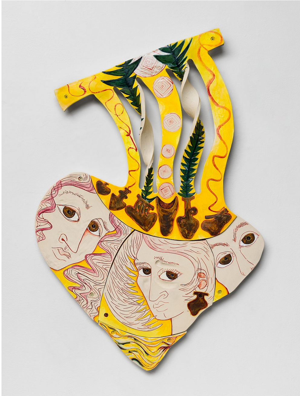
Gabriela Vainsencher Grow Your Own Muses , 2023 Porcelain with glaze, underglaze, and oil paint 30h x 20w in 76.20h x 50.80w cm GV042