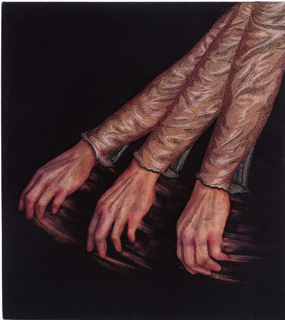
Katarina Riesing Swing , 2023 Dye and embroidery on raw silk 19h x 17w in 48.26h x 43.18w cm Riesing_055