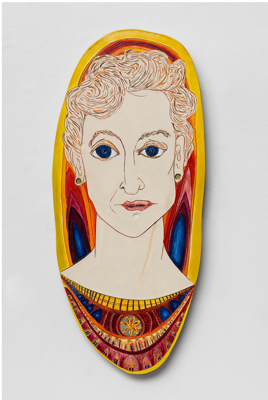
Gabriela Vainsencher The Cathedral (After Marta Morazzoni) , 2023 Porcelain with glaze, underglaze, and oil paint 21h x 9.50w in 53.34h x 24.13w cm GV041