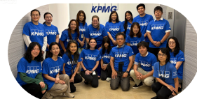
Fall JASSI Report printed & mailed support by KPMG LLP