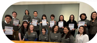
Spring JASSI Report printed & mailed support by MUFG Bank, Ltd.