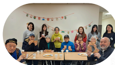
In-Person Tea Party

The mission of JASSI is to improve the quality of life for people who are in needs, living in the New York metropolitan area as well as other areas by providing social services. JASSI provides services in both Japanese and English to people free of charge regardless of age or income, as they face problems with language barriers, cultural differences, and differences in service systems.