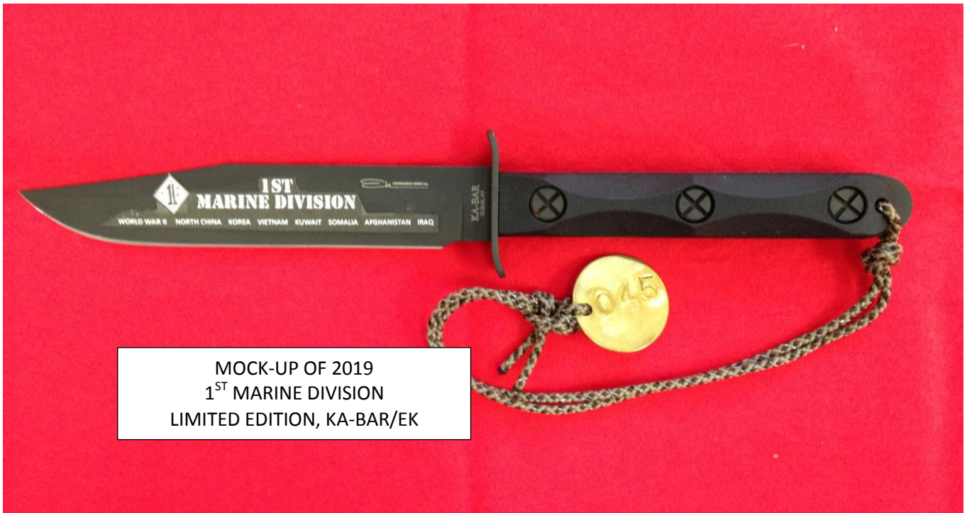
MOCK-UP OF 2019 1 ST MARINE DIVISION LIMITED EDITION, KA-BAR/EK

The 1 st Marine Division Association Limited Edition of only 200. Six percent (6%) of the knife sales price goes to the FMDA.