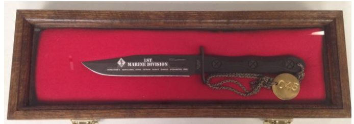
Optional Display Case of American Dark Oak, with locking glass lid. Wall mounts included. 6" x 16" x 2". The liner is Marine Corps Scarlet.