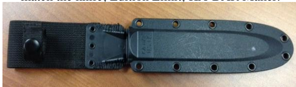
Sheath (included), designed and made by KA-BAR