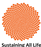
Sustaining All Life

Sustaining All Life (SAL) is an international grassroots organization working to end climate change within the context of ending all divisions among people. United to End Racism (UER) is a group of people of all ages and backgrounds, in many different countries, who are dedicated to eliminating racism in the world and supporting the efforts of all other groups with this goal. UER and SAL are projects of and use the tools of Re-evaluation Counseling. Re-evaluation Counseling (RC) is a well-defined theory and practice that helps people of all ages and backgrounds exchange effective help with each other in order to free themselves from the emotional scars of oppression and other hurts. By taking turns listening to each other and encouraging emotional release, people can heal old hurts and become better able to think, to speak out, and to organize and lead others in building a world in which human beings and other life forms are valued and the environment is restored and preserved.