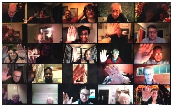
Laying on of Hands