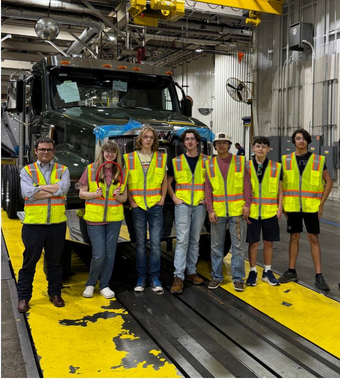
The community class visits Freightliner as they apply the ideas of systems thinking to area businesses.