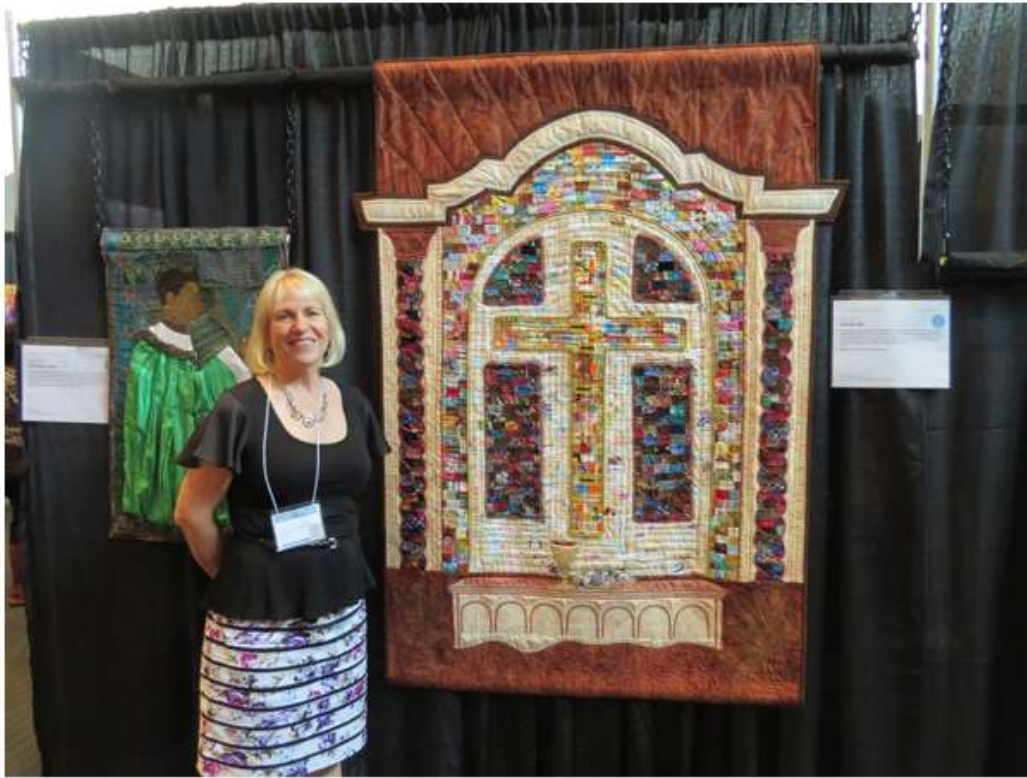
These quilts are from an exhibit in the Sacred Threads quilt show in Herndon, Virginia.