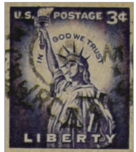
U.S. #1035. Issued 1954. 3¢ Statue of Liberty, part of the "Liberty Series."