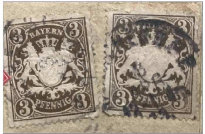
Bayern Pfennig. Date unknown. 3¢ stamp. Bush Family collection.