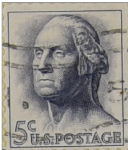
US #1229. Issued 1962. 5¢ Washington bust by Jean-Antoine Houdon. King County Masonic Lodge, various.