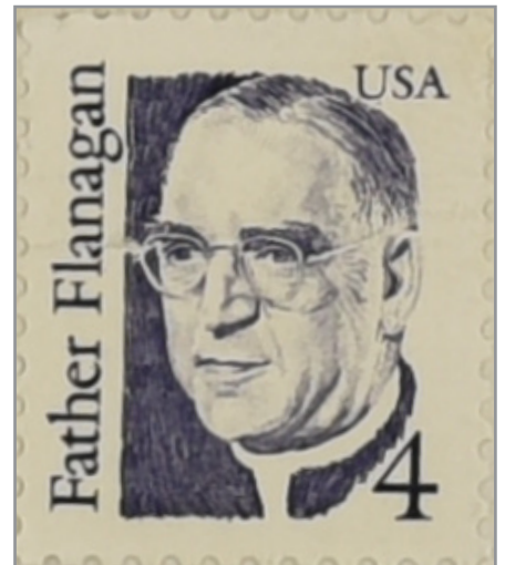
U.S. #2171. Issued July 14, 1986. 4¢ Father Flanagan.