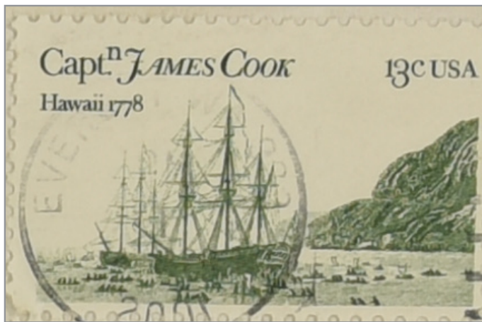
U.S. #1732. Issued 1978. 13¢ Captain James Cook commemorative.