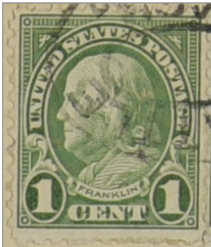
U.S. #578. Issued 1923. 1¢ Ben Franklin.

Here are just a few of the stamps that found their way into our collections: