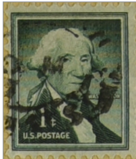
U.S. #1031. Issued 1954. 1¢ George Washington Liberty Series.