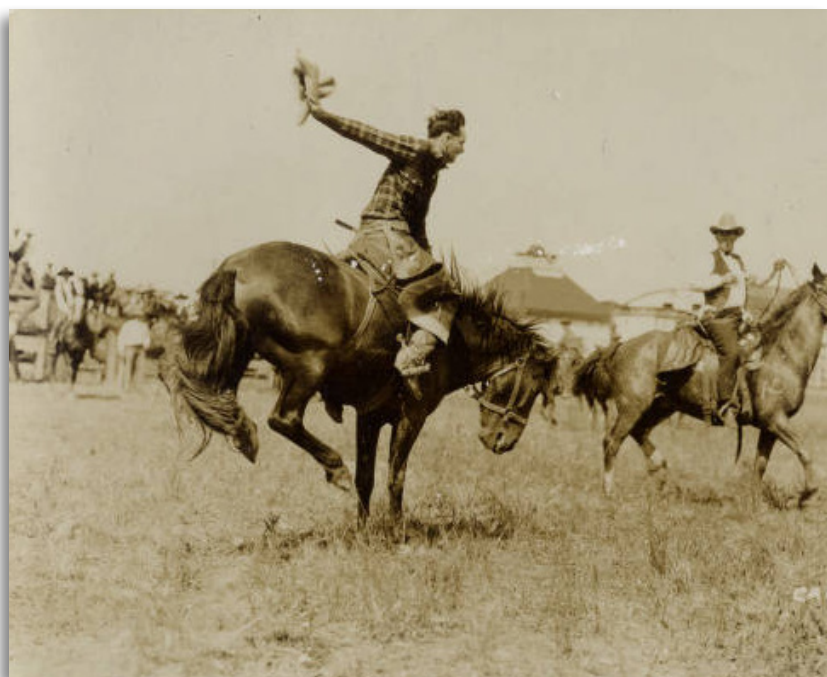
Yakima competing in 1919 Calgary Stampede rodeo. Photo courtesy of the University of Calgary Archives.

He learned the skill of bronco riding in the expanse of Eastern Washington ranches, competing in rodeos around the West and eventually became a world champion in 1917. Here is a photo of Enos in the 1919 Calgary Stampede courtesy of the University of Calgary Archives.