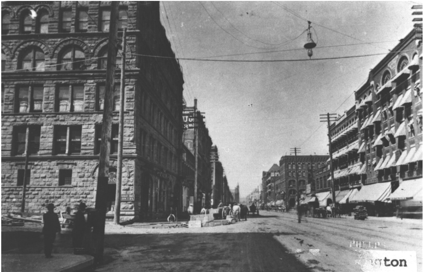
Downtown Spokane, 1890s.

So who were DePape and Saillard? The couple were French immigrants living in Spokane in the 1890s. Spokane rapidly expanded during this time, as immigrants and Easterners flooded west, seeking opportunity and advancement. This couple went by multiple names, as was common for immigrants and for people living on the edges of respectable society. They anglicized their names to be more easily pronounced by English-speakers, and perhaps to assimilate into American culture. In a time before government-issued photo ID cards and Social Security numbers, it was easy to simply change the spelling of your last name or alter it all together.