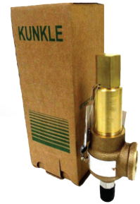
Model 913 Air/Gas, Steam & Liquid "UV" "V" for Special Use

Please contact us for more information and for any of your valve service needs.