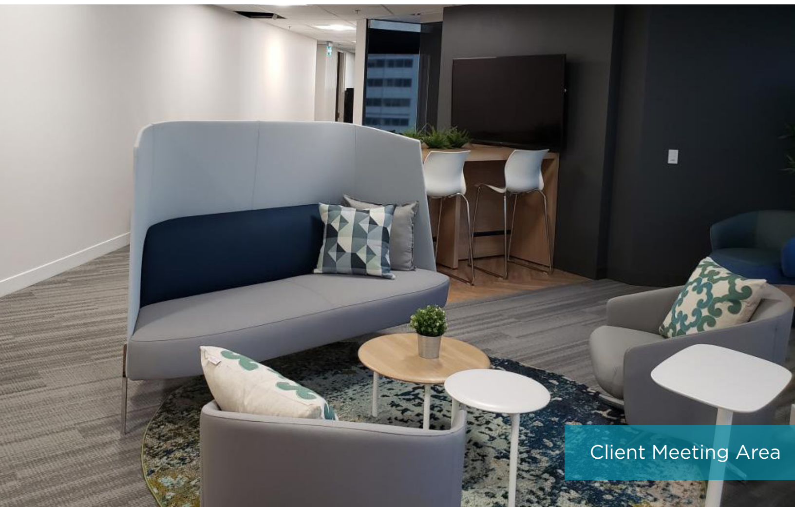
Client Meeting Area