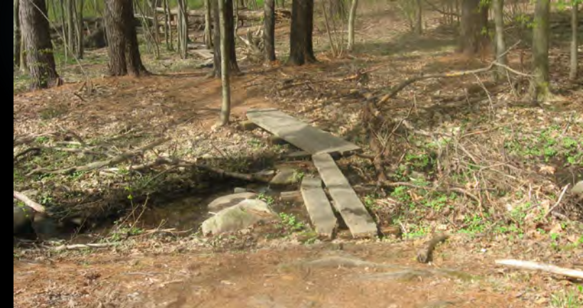
Jun 12, 2023, 9:36 A