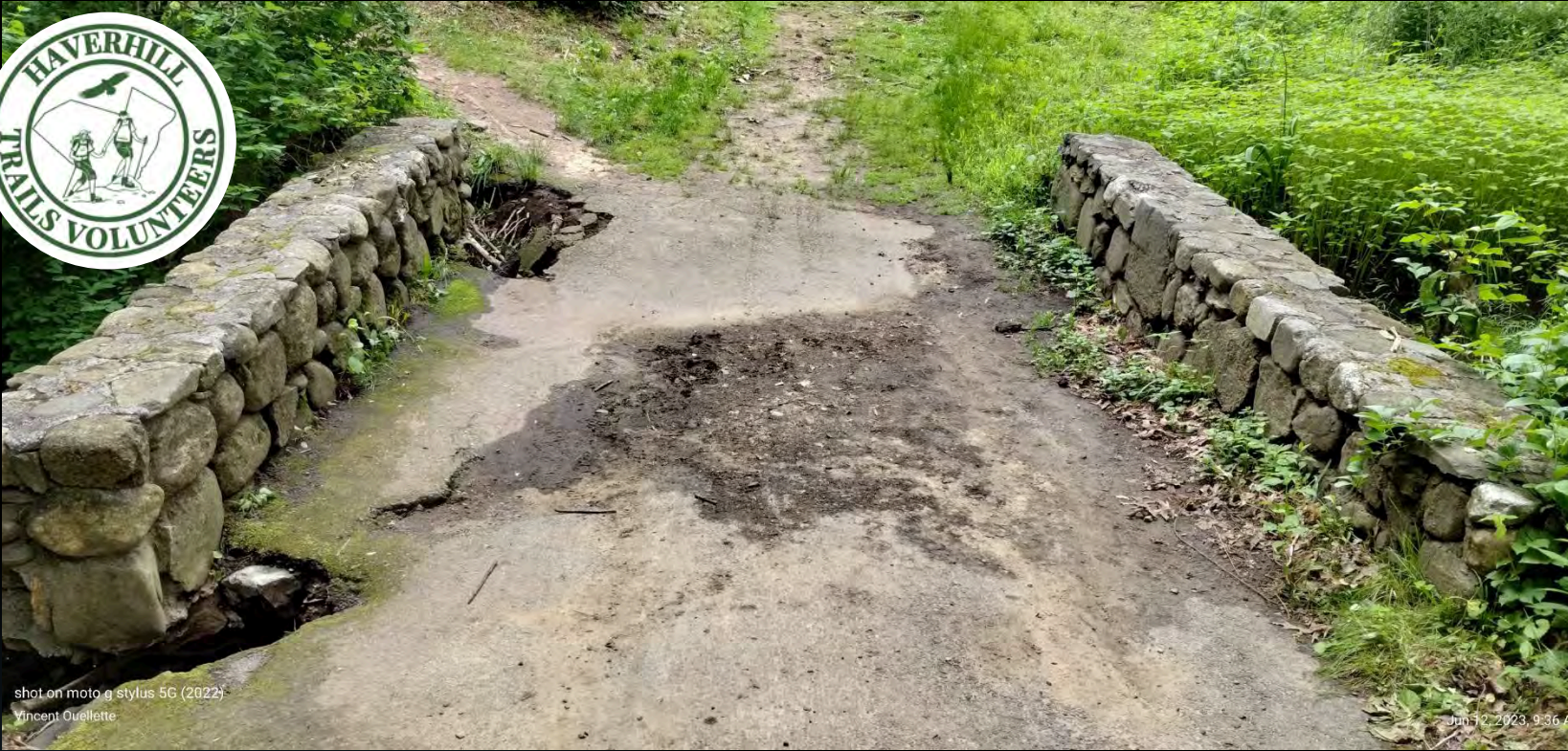
shot on moto g stylus 5G (2022) Vincent Ouellette