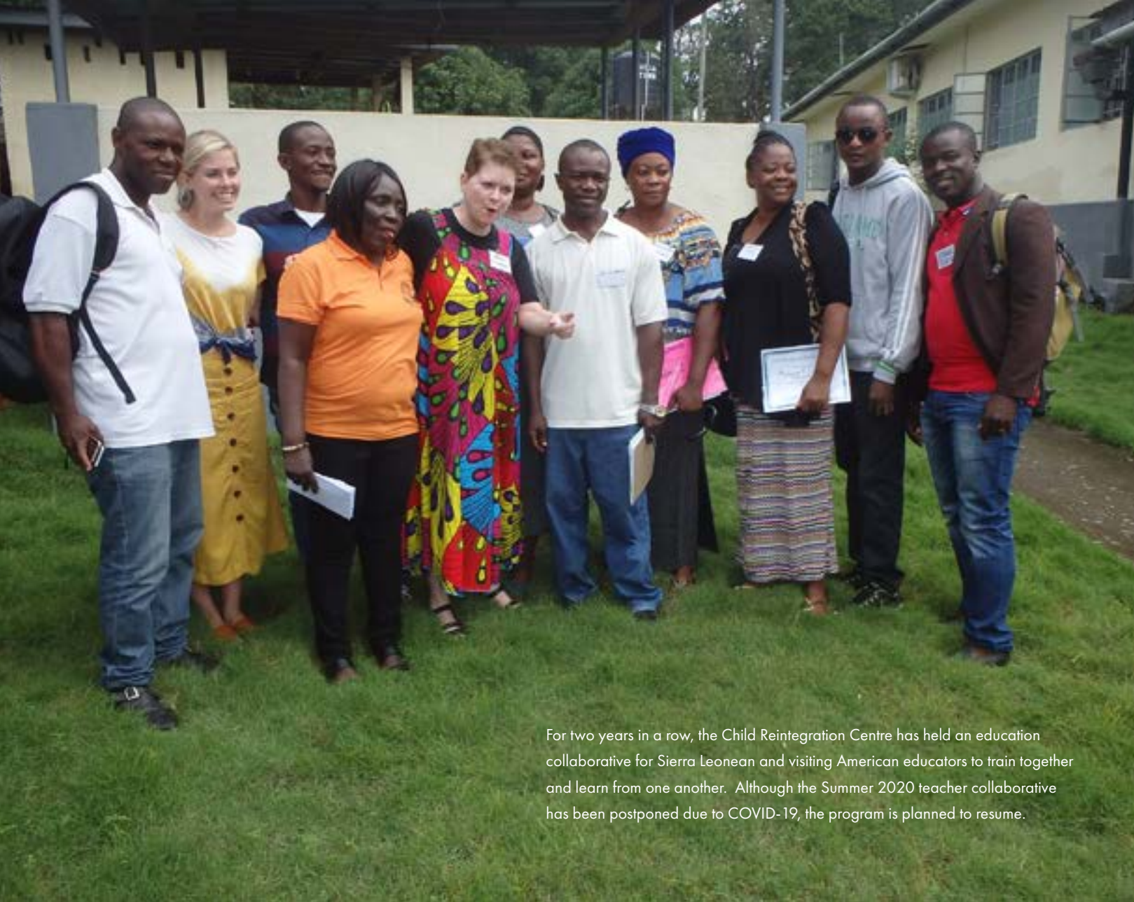
For two years in a row, the Child Reintegration Centre has held an education collaborative for Sierra Leonean and visiting American educators to train together and learn from one another. Although the Summer 2020 teacher collaborative has been postponed due to COVID-19, the program is planned to resume.

COVID-19, in its lack of discrimination in who it infects, is showing us that we have needs and fears of our own, and that our radical collaboration with our partners flows in both directions across the ocean that separates us. We may not be in the same boat, but we are in the same storm now.