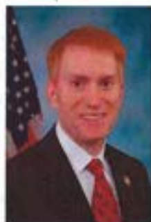
JAMES LANKFORD, 54 Republican