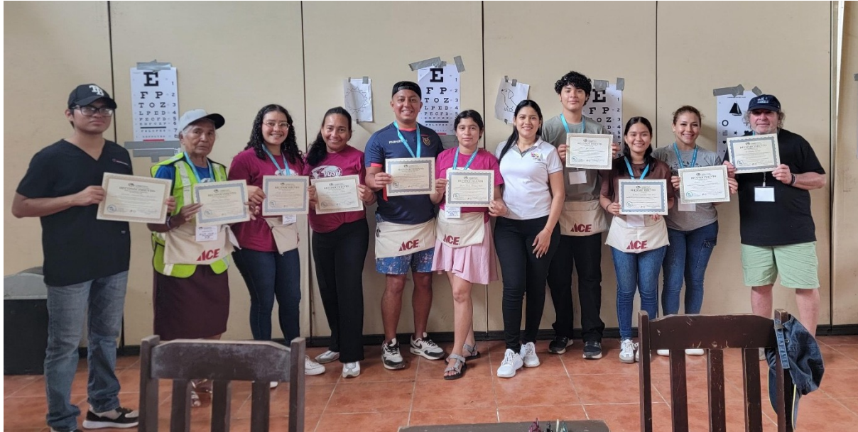
Image 4 At the end of the clinic, all volunteers received a certificate of appreciation.

Over the four-day clinic period, they saw 3,937 patients, increasing the total patient service to almost 60,000 patients over the past 20 years.