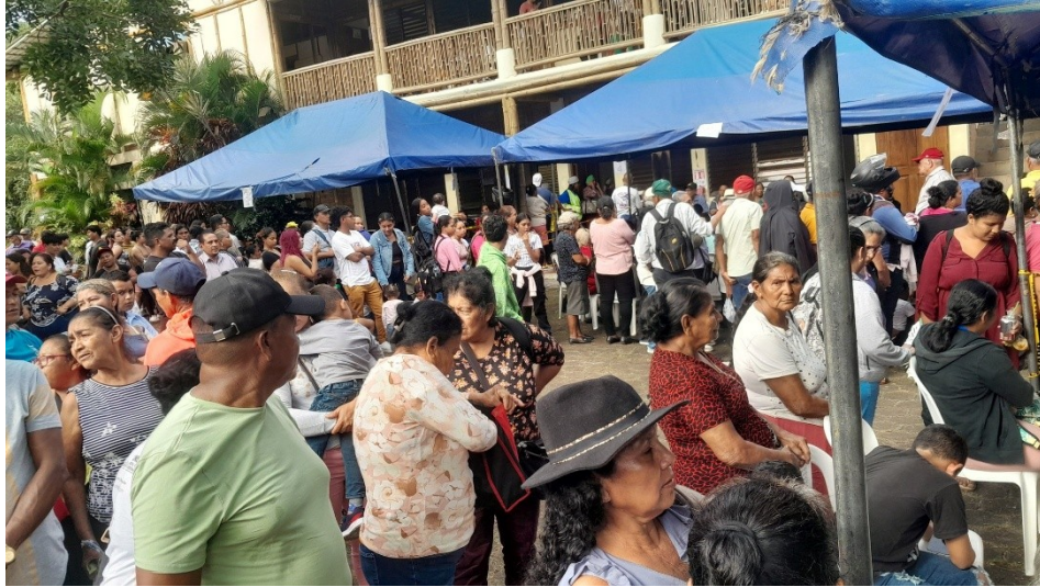
Image 1 Patients waiting to be seen.

VOSH-Connecticut held its annual eye care clinic in San Juan del Sur, Nicaragua on January 10-18, 2025. This was the 24th year of service to the San Juan del Sur area and the 21st organized by VOSH-Connecticut, along with three previous ones organized by SVOSH-NECO.