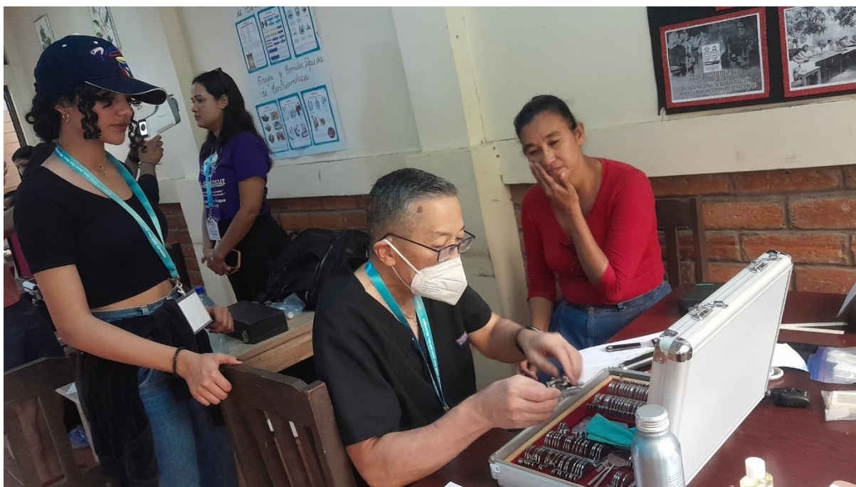
Image 3 and 4 OD teams at work.