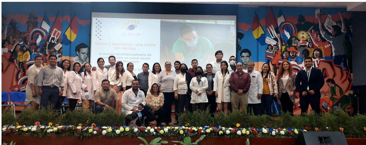
Image 1 In-person attendees to the International Forum Vision and Education, UNAN Managua

This high-level event had the presence of representatives from the Nicaraguan Ministry of Health and the Ministry of Education who presented Nicaragua's Community and Family Health Model (MOSAFC for its Spanish acronym) and inclusive education in Nicaragua. Other key local partners attending the event were the municipalities that help with the coordination of the humanitarian work. UNAN's optometry program shared the progress made through the rural satellites of UNAN called UNICAMs (Universidad del Campo) in La Dalia, Nueva Guinea, and San Juan del Sur where optometry is being taught and for which VOSH/International donated equipment.