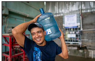
A man in Honduras receives much needed safe water after Hurricanes Eta and Iota.

We are grateful for the dedicated supporters who enable us to serve with integrity, building safe water solutions that transform lives.