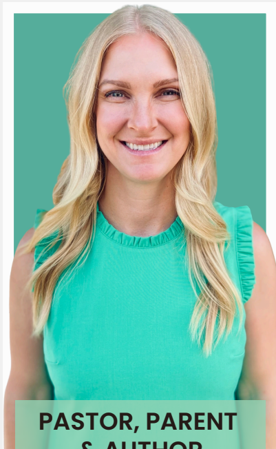
PASTOR, PARENT & AUTHOR

We have copies, let us know if you'd like one!