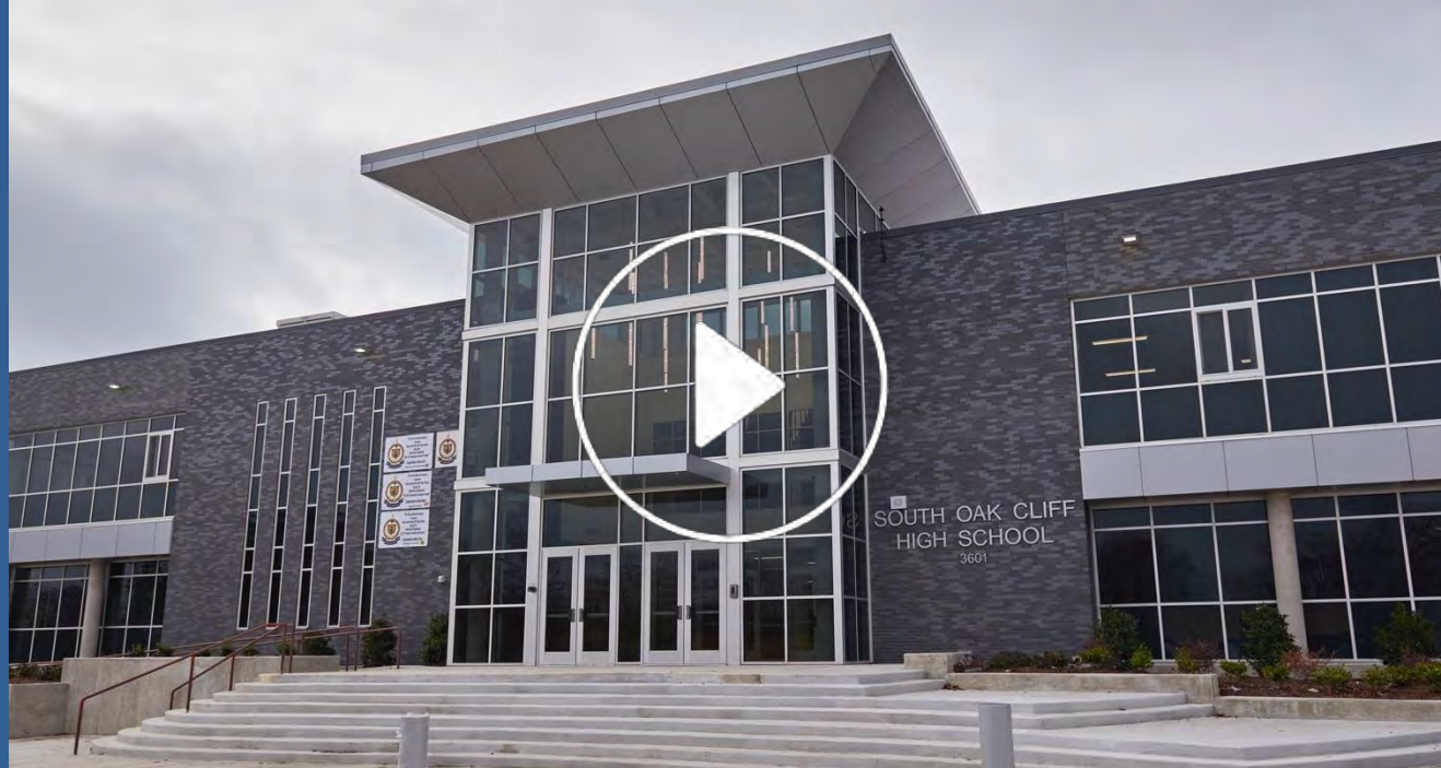
SOUTH OAK CLIFF BOND RENOVATION