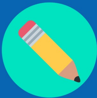
English Language Arts