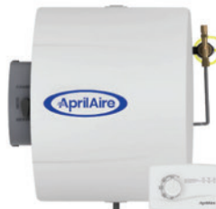
Aprilaire Whole House Large Bypass Humidifier