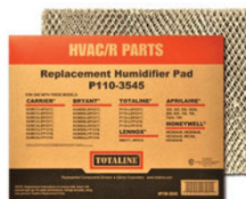
Replacement Humidifier Water Panel Evaporator