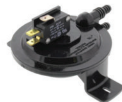
Universal Pressure Switch .20-1.0 WC