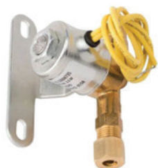
AprilAire 24V Humidifier Solenoid Valve