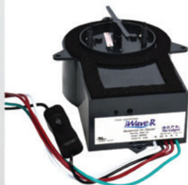
iWave-R Residential Air Ionization System