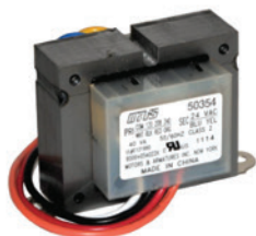
Universal Foot Mount Transformer 120/208/240 24V 40VA