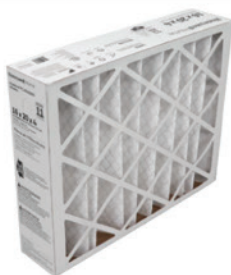
Res. Air Cleaner Replacement Media Filter F100/F200