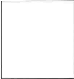
Photograph of alien removed

Port, date, and manner of removal: _____