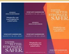
TABLE TENT, TRI-FOLD