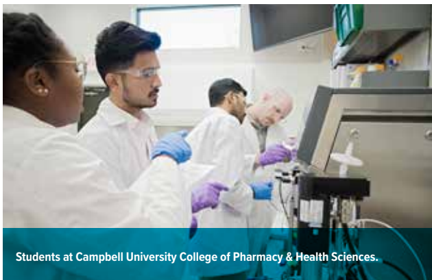
Students at Campbell University College of Pharmacy & Health Sciences.

resources and experienced personnel to help our clients with formulation development, as well as analytical and stability testing.”