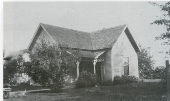
Fishers Church parsonage on Lantern Road prior to 1927.

It is unknown exactly when the first parsonage was built on Lantern Road, but the picture shown here served well as the parsonage through 1927. After the dedication of the new church building, the Fishers congregation welcomed Rev. Hunt as their pastor in 1906. Soon after, in 1907, it was determined that Delaware Township needed a new school to educate the growing population of students. This new school was built just across the street from the Fishers Methodist Episcopal Church (Fishers Elementary sits on that site at the present time).