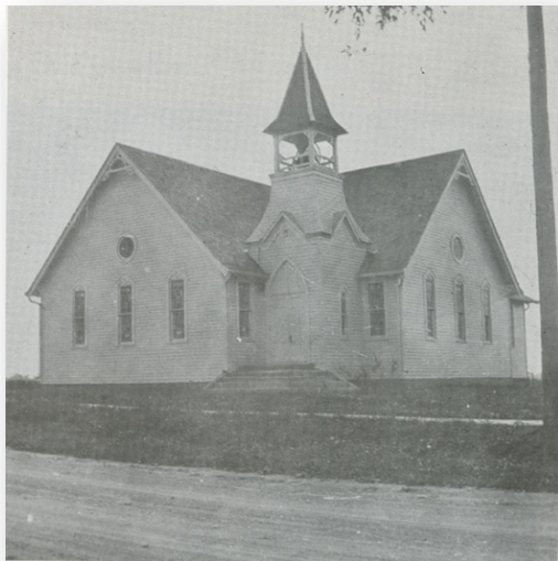
Lantern Road Church Building, circa 1924.