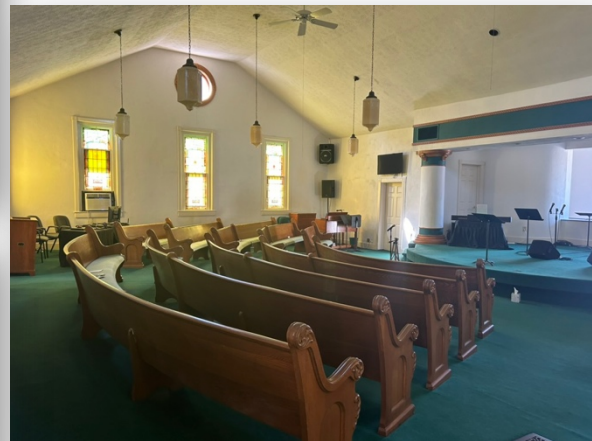
Photographs of inside the 1905 church building, March 13, 2024.