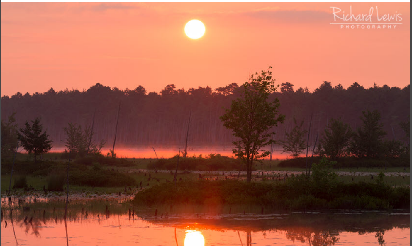
Sunrise in the New Jersey Pinelands.