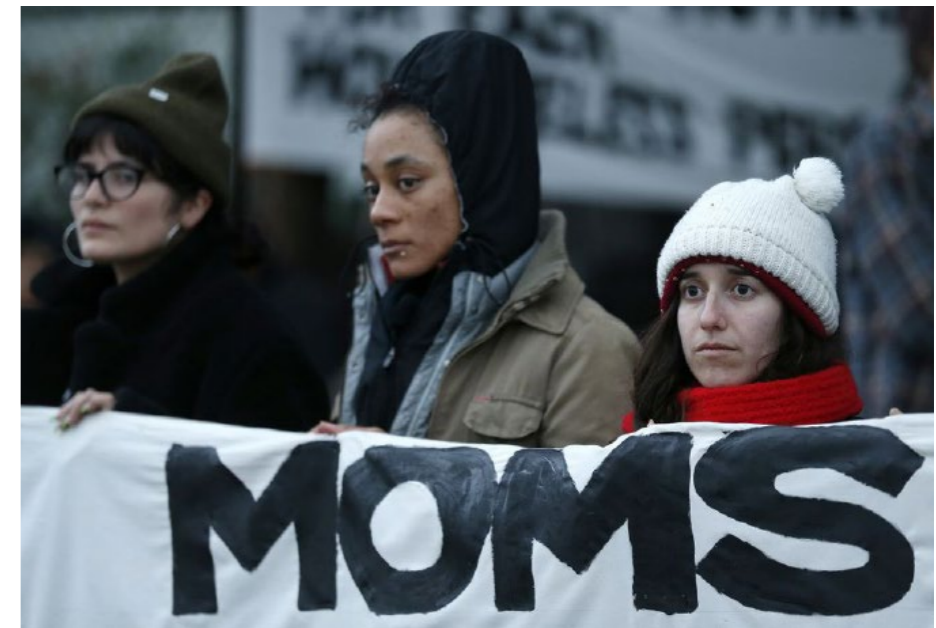
Moms 4 Housing supporters protest in front of a vacant house in West Oakland.

California will provide nearly 300 state properties for use as homeless shelters and should change its laws to make it easier for local officials to get the mentally ill off the streets, Governor Gavin Newsom said on Wednesday.