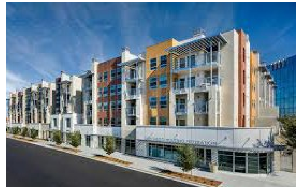
Photo of Iowa Street Senior Housing in North Park, San Diego

Affordable housing is well known for maintaining stability during an economic recession. Data shows that the asset class has better occupancy and more stable rents during past recessions, making affordable housing a recently popular investment class for investors.