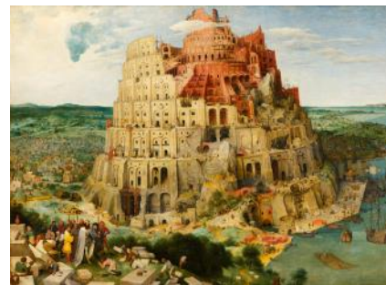
Pieter Bruegel, Tower of Babel

Join us in the Parlor each Wednesday at 10:00 am for our weekly adult Bible Study. We have just begun a study of the book of Genesis.