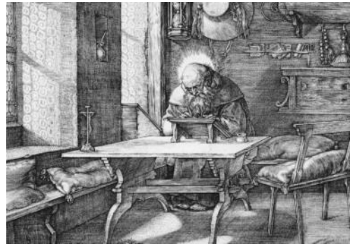
Albrecht Dürer, Saint Jerome in His Study

Are you pursuing higher education, or do you know an Episcopalian in the area who is? This Fall, Trinity will again name Stoller Scholars and offer scholarships to help support post-secondary students in their endeavors.