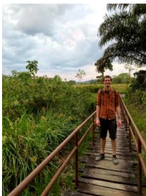
Boca Tapada, Costa Rica