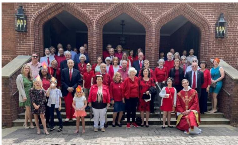
Trinity's parish photo at Pentecost