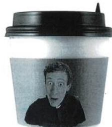
Youth Bible Study Wednesdays 6:00-7:00 Iron Bank Coffee

Trinity Youth - we will start again our weekly Wednesday Bible Study at Iron Bank Coffee on January 24. See you there!