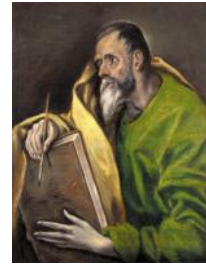
El Greco, Saint Luke (1614)

This summer, Trinity's Adult Bible Study has been studying the Gospel of Luke. Saint Luke is known in Christian tradition as a physician and a painter, and his Gospel account is where we find such memorable stories as the Annunciation, the parable of the good Samaritan, and the parable of the prodigal son. Each week, Trinity's Bible study group will take another step along with Jesus in his life and ministry as told the Gospel of Luke, exploring the meaning of Scripture and its relevance for our own life of faith. Trinity's Adult Bible Study meets over coffee each Wednesday at 10 a.m. in the parlor. Hope to see you there!