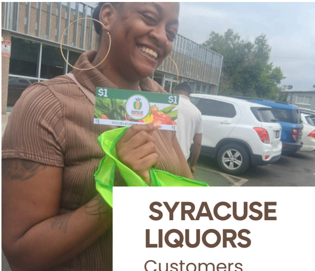
SYRACUSE LIQUORS Customers

These narratives embody the voices, experiences, and realities of individuals who initially engaged with Double Up Food Bucks through Sinergia's outreach initiatives. Each interaction illustrates the program's human impact and underscores the significance of delivering clear, accessible, and culturally relevant information.