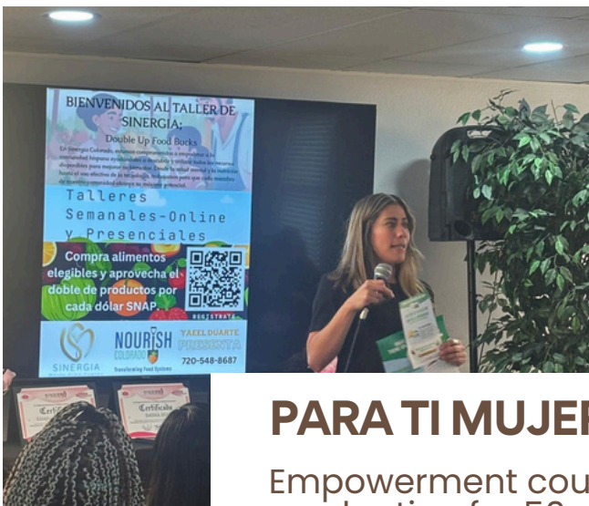
PARA TI MUJER Empowerment course graduation for 50 women