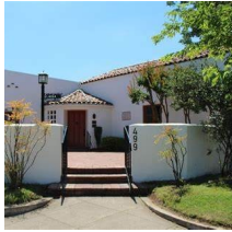
Women's Club Visit