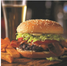
Red Robin Fundraiser