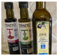
Olive Oil Fundraiser

We are thrilled to share the success of our Red Robin Fundraiser held on Tuesday, November 12! Thanks to the generous support of our community and the hard work of everyone involved, we raised over $220 to benefit the President's Passion High School Scholarships.