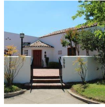
Visit to the Women's