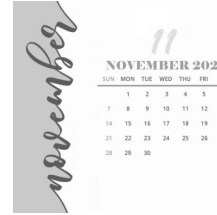
Calendar of Events