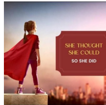
She Believed She Could, So She Did