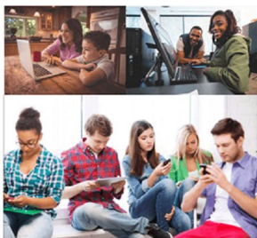
Online Registration UNIT GUIDEBOOK

Here are the final actions you should take to make sure your unit is ready for members to start registering online: