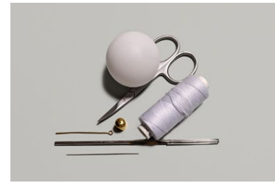
- scissors; pliers

- crocheting yarn; a Big Eye needle or a stringing needle with a loop made from a thin thread; a 1 mm hook; a long eye pin; a cap; a ping-pong ball or a 3.5-4.0 cm polystyrene ball