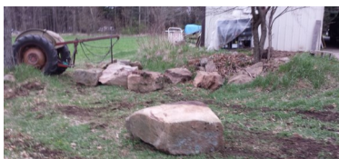
Making more room at the warehouse!

*Reminder ....please contact Lorraine if you will be bringing any Silent Auction Items