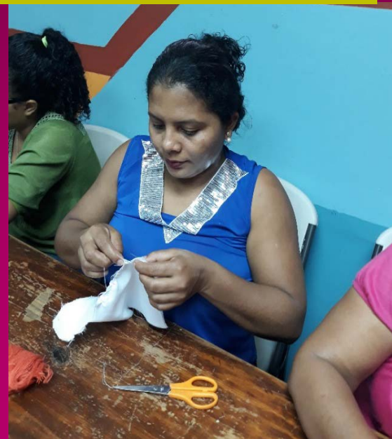
Betania from Mujeres de Israel L.C