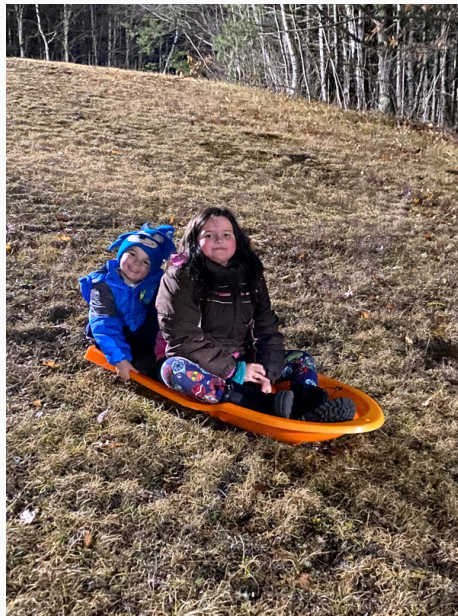
Trying sled with no snow