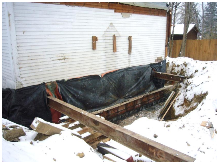
Construction photographs - December 2016 - Former 1881 Union Church in Adirondack - for Museum Use Church was 'suspended' on cribbing & I-beams and now is sitting on its New Concrete Foundation!